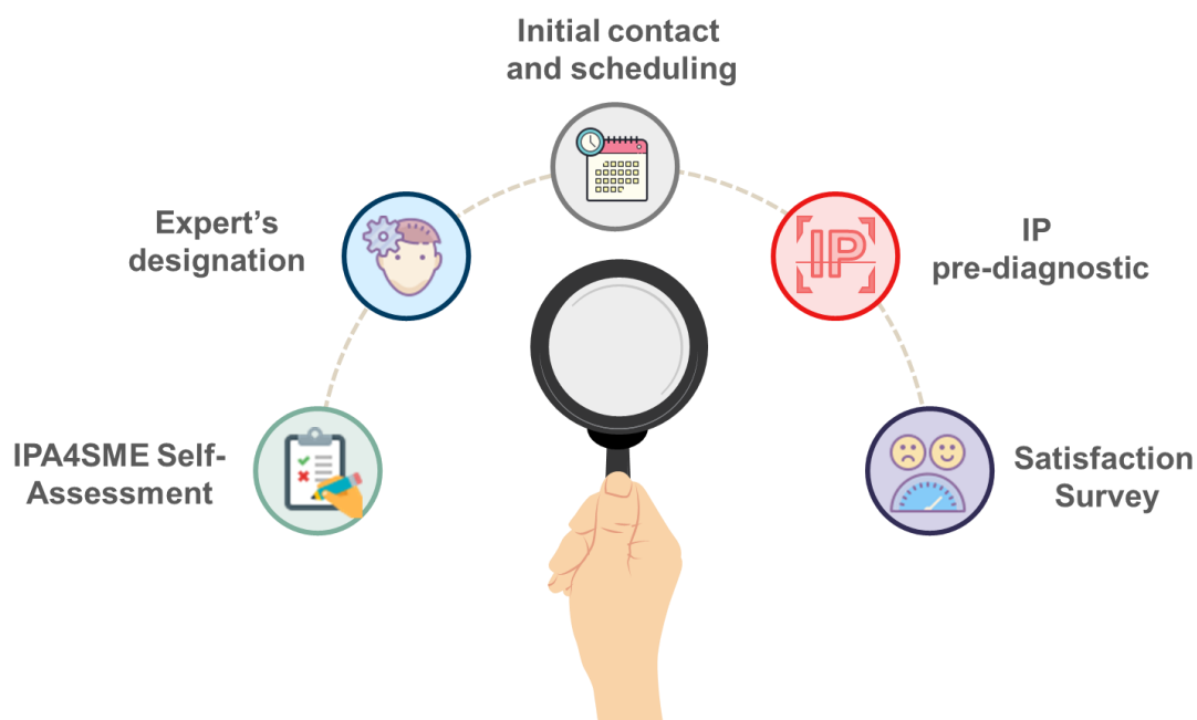
FIGURE 1: SERVICE 1 WORKFLOW

The steps involved in activating and receiving the IP pre-diagnostic support service are the following: